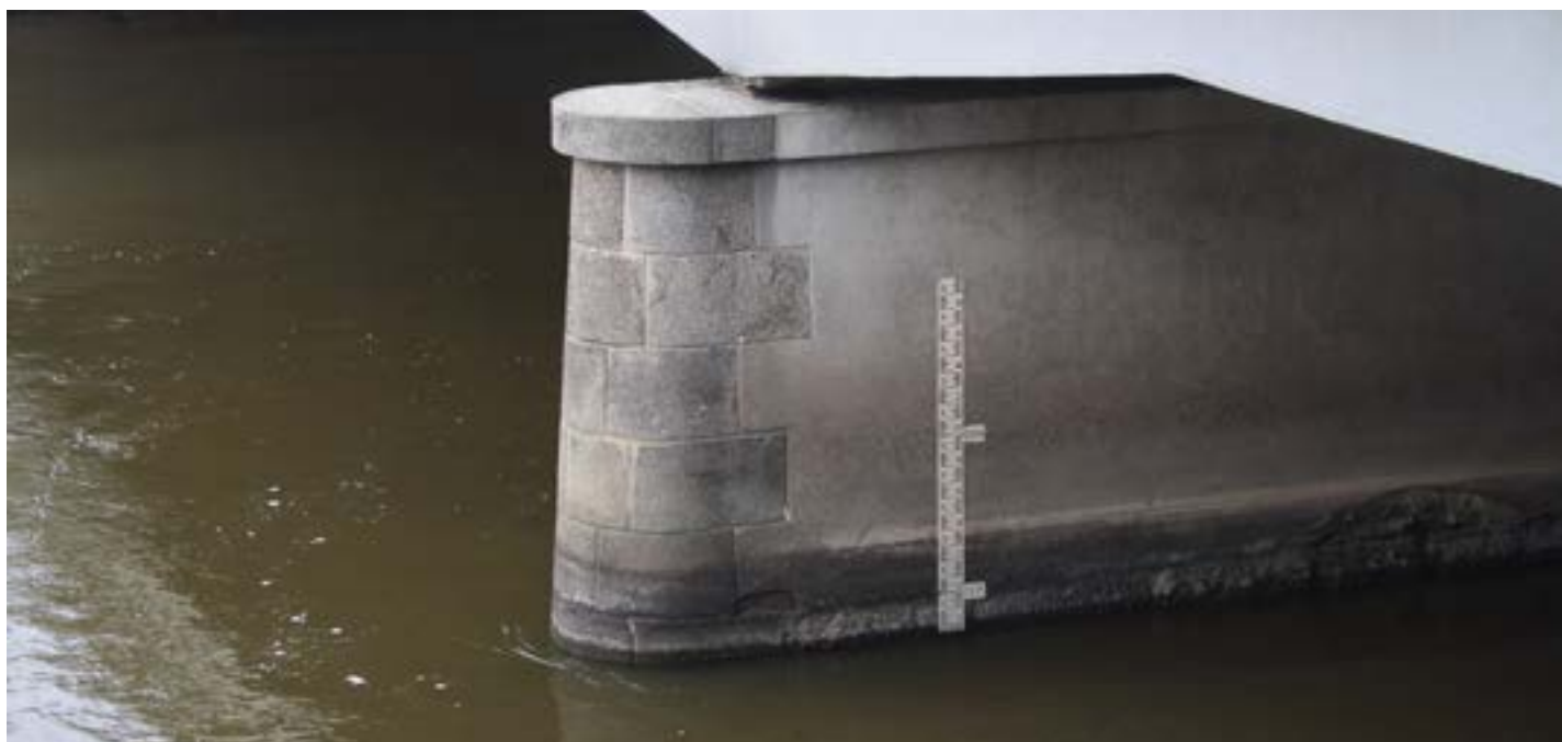
Staff gauges installed on bridge pillar

It is a centering devices that ensures easy and consistent measurements .